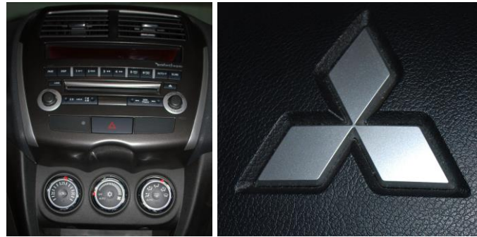
Fig9. ASX Console and knobs