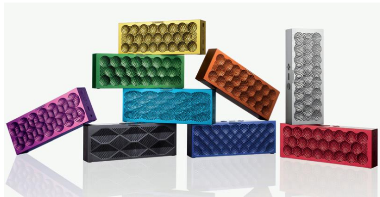
Fig4. In these speakers, texture is applied for functional reasons